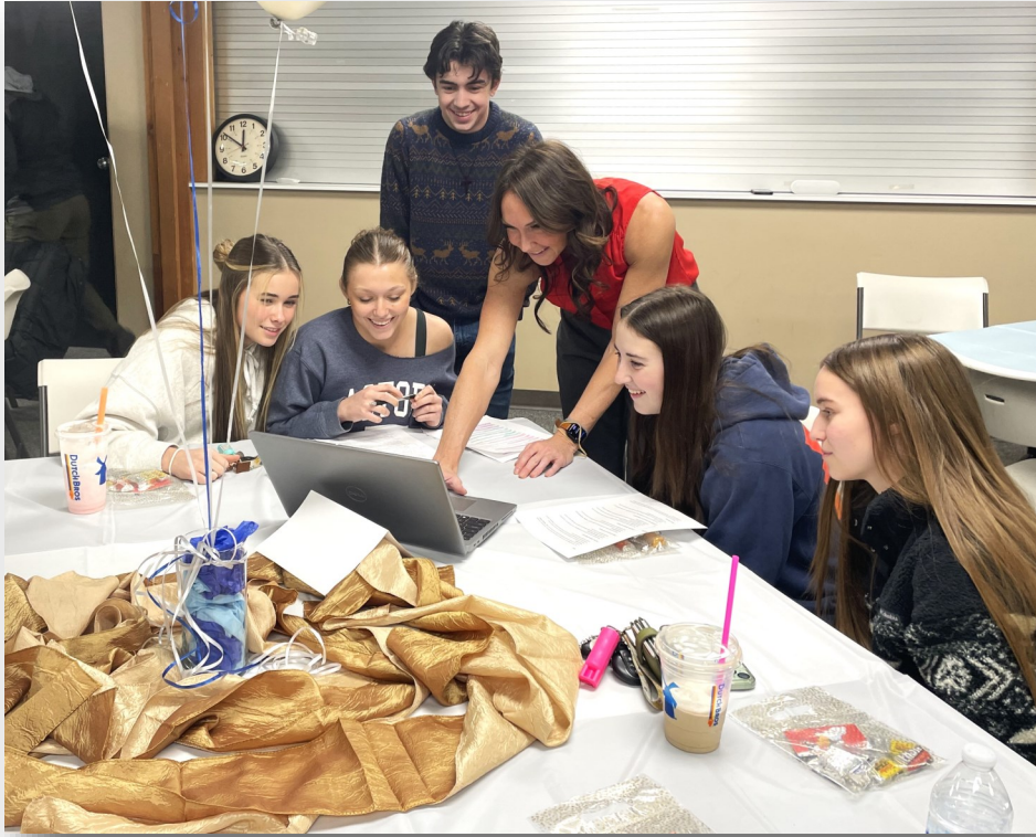
STAND student ambassadors preview their presentation.