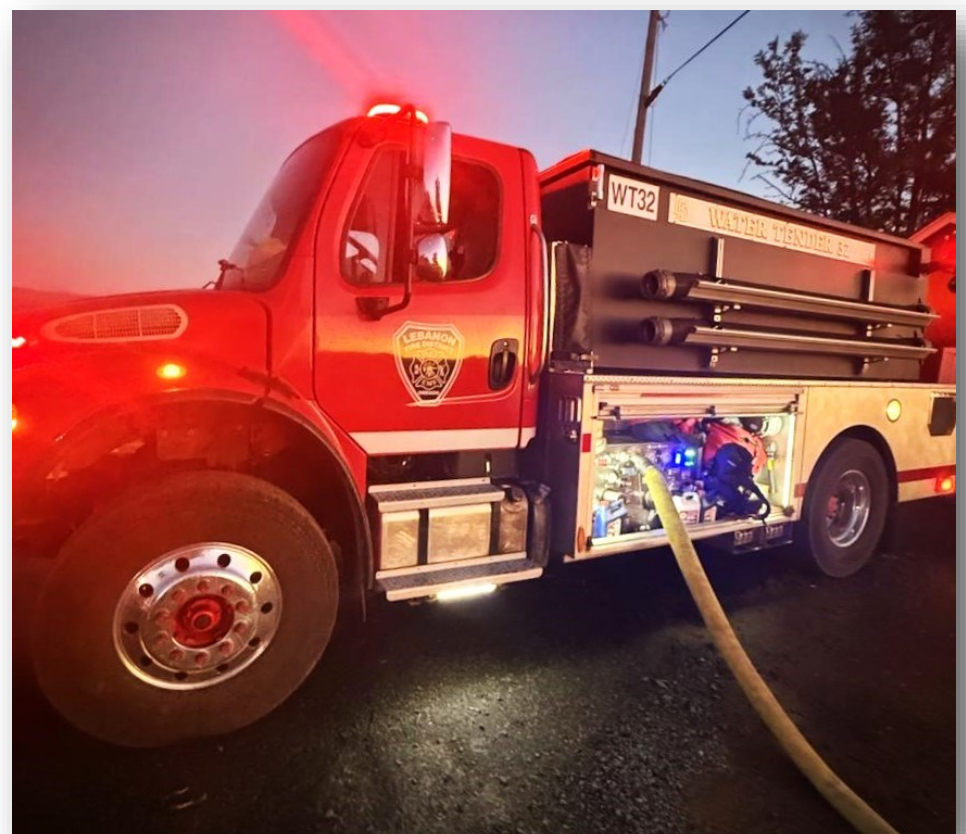
A water tender from the Lebanon Fire and Ambulance District.

The Palisades Fire destroyed 6,837 homes/buildings and burned 23,448 acres. It started on January 7 and was propelled by high winds.