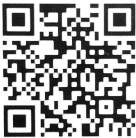
Scan to learn more about Linn Together.

Learn more about Linn Together at www.linntogether.org , visiting "Linn Together" on Instagram, or calling 541-967-3819.