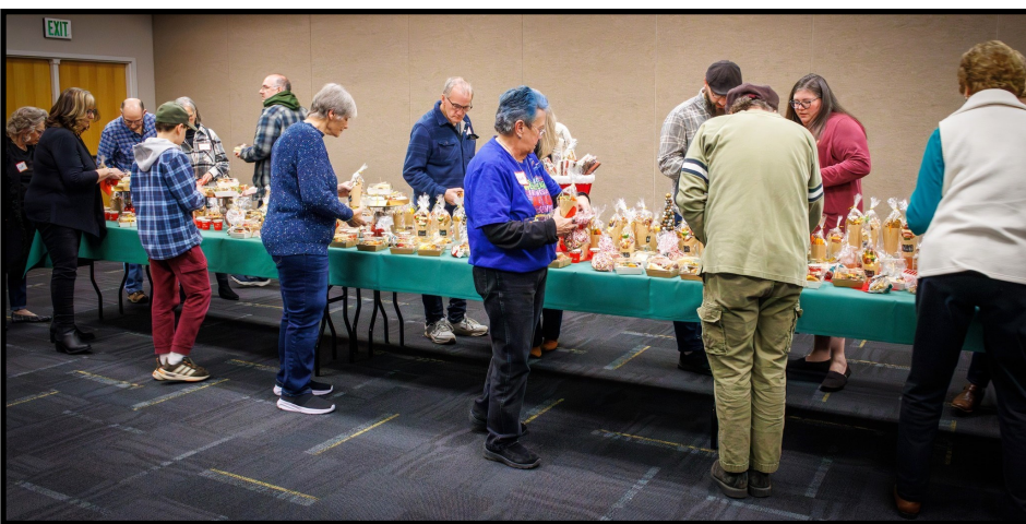
Yummy snack and dessert packs!