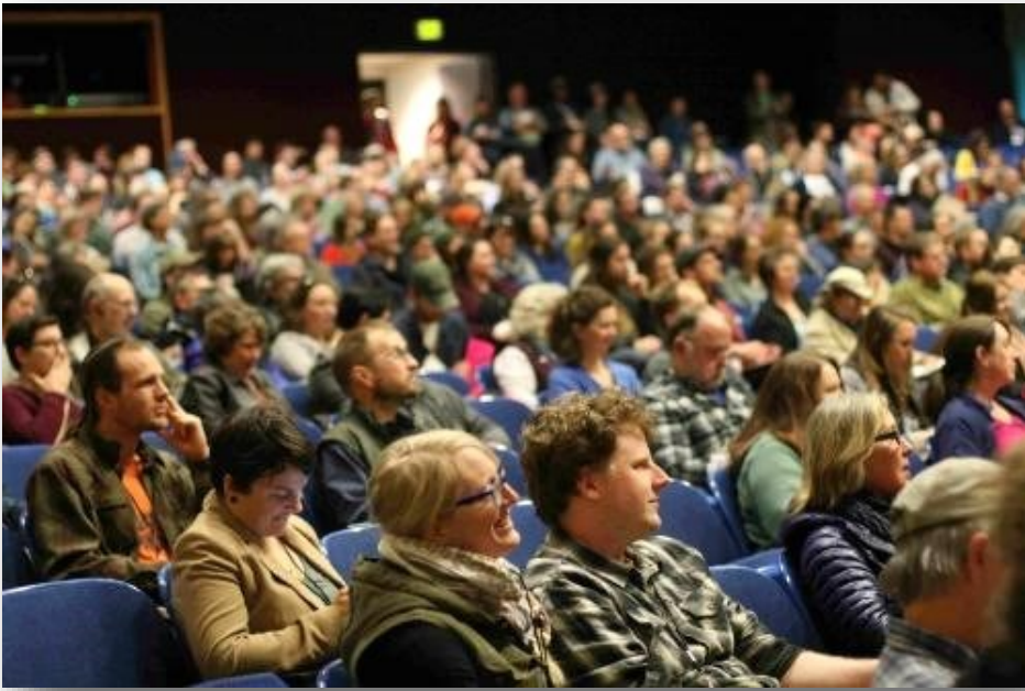
— OSU Extension Service