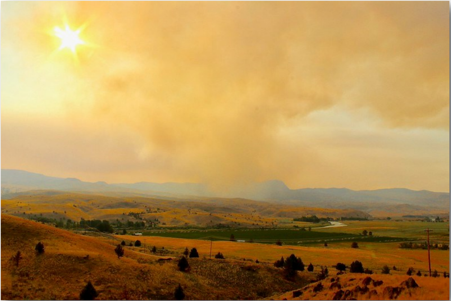
Image of smoke plume from a wildfire over rangelands