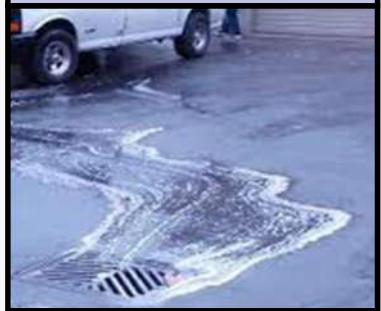
4.) Discharges of wash water from mobile operations, such as mobile automobile or truck washing, steam cleaning, power washing, and carpet cleaning.