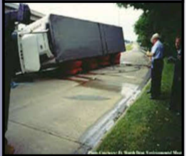
2.) Discharges of wash water resulting from the hosing or cleaning of gas stations, auto repair garages, or other types of automotive services facilities.