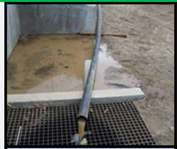
3.) Discharges resulting from the cleaning, repair, or maintenance of any type of equipment, machinery, or facility, including motor vehicles, cement-related equipment, and port-a-potty servicing.