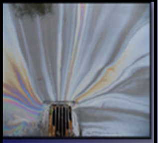
6.) Discharges of runoff from material storage areas, which contain chemicals, fuels, grease, oil, or other hazardous materials from material storage areas.