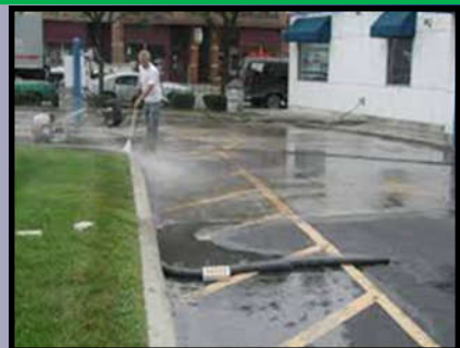
5.) Discharges of wash water from the cleaning or hosing of impervious surfaces in municipal, industrial, commercial, or residential areas (including parking lots, streets, sidewalks, driveways, patios, plazas, work yards and outdoor eating or drinking areas.