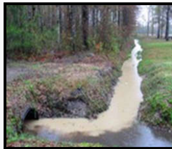
8.) Discharges of sediment, unhardened concrete, pet waste, vegetation clippings, or other landscape or construction-related wastes.