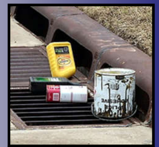
9.) Discharges of trash, paints, stains, resins, or other household hazardous waste.