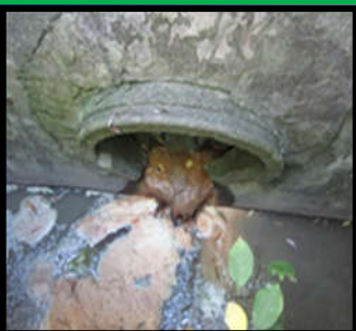
1.) Septic, sewage, and dumping or disposal of liquids or materials other than stormwater.

The prohibited non-stormwater discharges include, but are not limited to, the following: