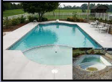
7.) Discharges of pool or fountain water containing chlorine, biocides, or other chemicals; discharges of pool or fountain filter backwash water.